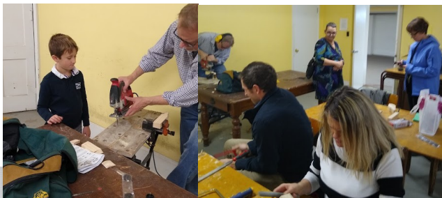
Racers are still working away!!